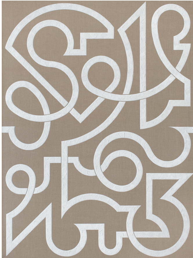
Adagio , 2018. Oil on linen, 72 x 54 inches