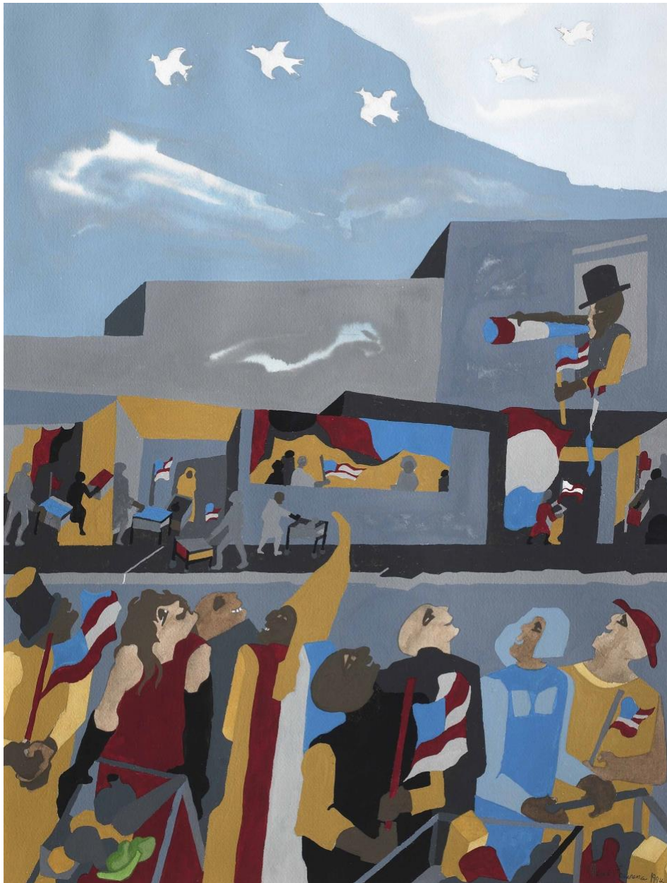
Jacob Lawrence Supermarket - Celebration, 1994 Gouache on paper 26 x 20 1/2 inches