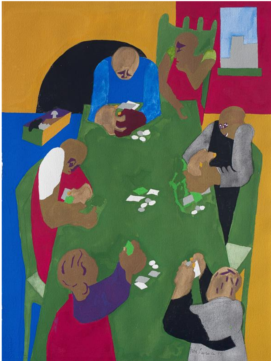
Jacob Lawrence Games-Five Card Stud, 1999 Gouache on paper 24 x 18 inches