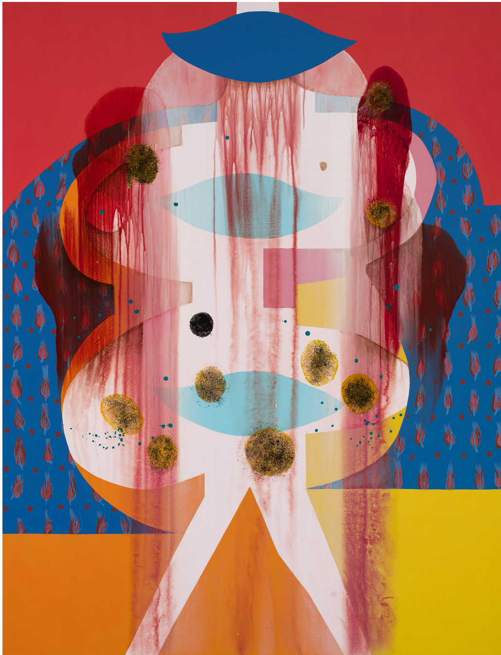
Carrie Moyer La Signora , 2020 Acrylic, graphite, glitter on canvas 78 x 60 inches