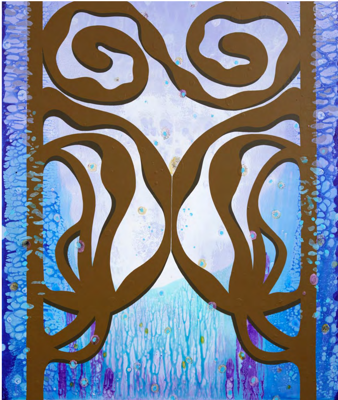
Carrie Moyer Wayfinding , 2020 Acrylic, glitter on canvas 78 x 66 inches