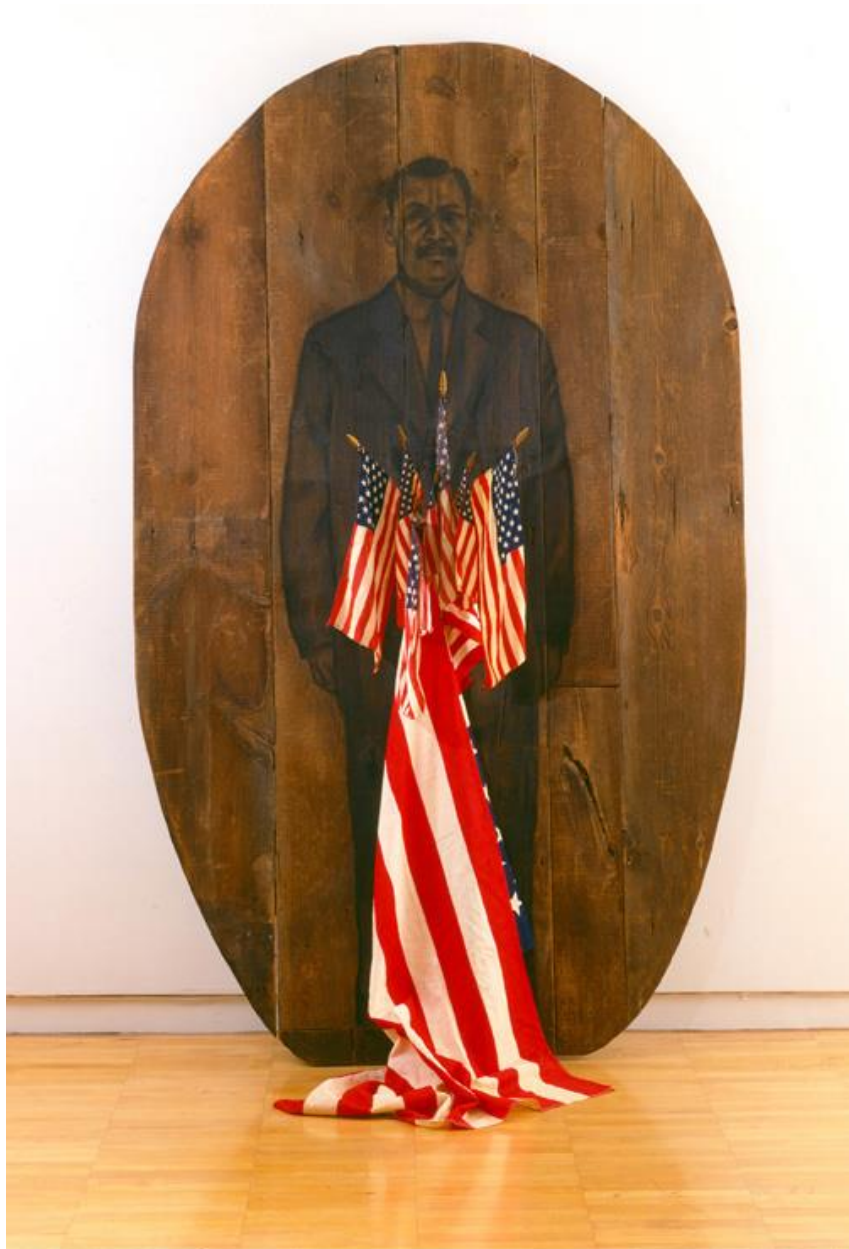
Whitfield Lovell America , 2000 Charcoal on wood, flags 89 x 53 1/2 x 20 inches