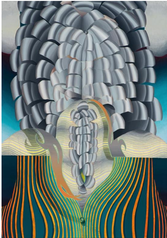
Galea , 2022. Oil on linen, 50 x 35 inches.