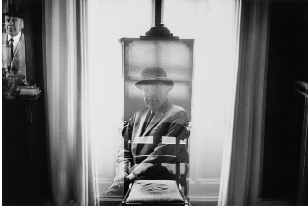
Magritte with Easel, 1965. Gelatin silver print, 15 1/8 x 22 3/4 inches

In August, 1965, Duane Michals arrived at René Magritte's home in Brussels to take the famous surrealist's portrait. Michals made the connection through a friend of a friend and had no idea what to expect from the painter who was a large influence on his own photographs. Michals's photographs refract Magritte and his space through his own engagement with Magritte's art. He writes, "what so engaged me in Magritte's work was its ability to perplex. In his world, I could not be sure of anything." The portraits convey the surrealist sense of humor shared by the two artists, using double exposures and other techniques to perplex the eye. Magritte is dressed in a dark suit and bowler hat, "the familiar Magritte man" of his paintings.